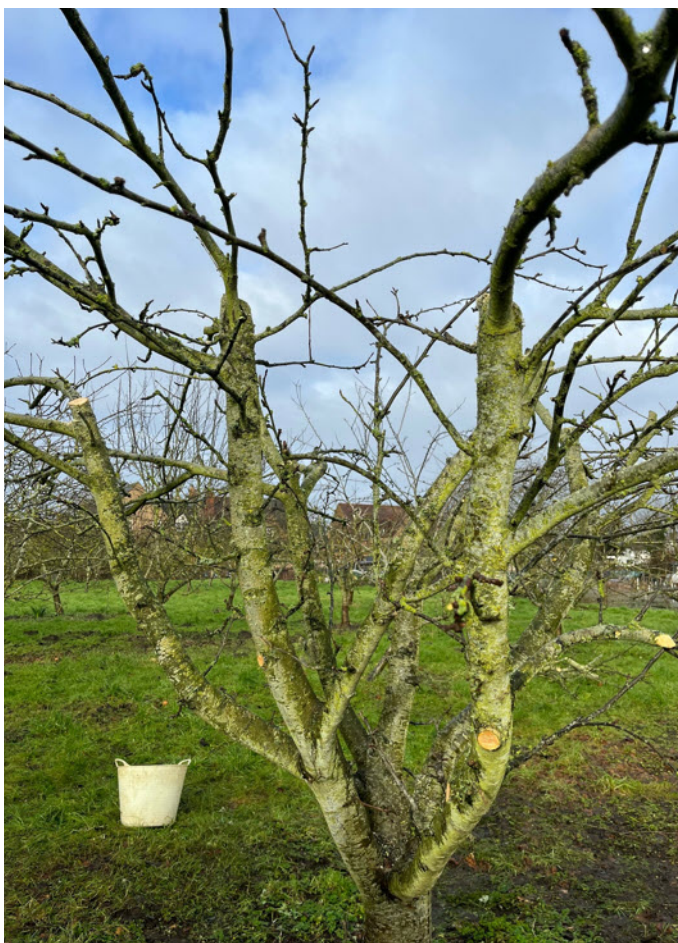
Pruned apple tree