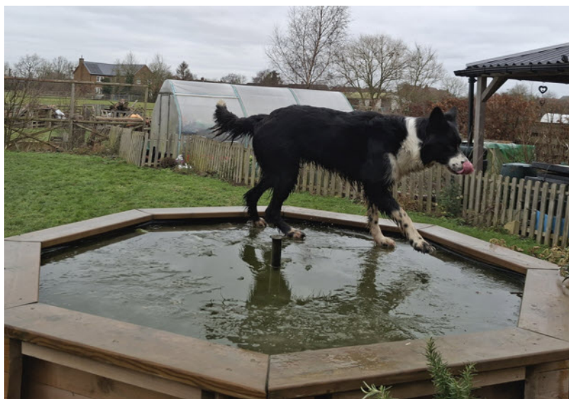
Bess, the collie